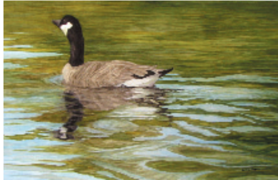
"Canada Goose" by Bobbie Myers Honorable Mention Society of WA Artists 2009 Fall Show