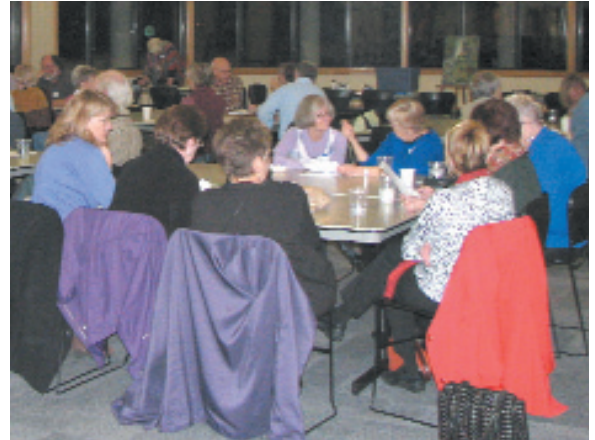
Each table recorded their ideas for improving SWWS.

All in all, a very successful and productive meeting.