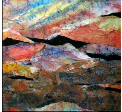
2nd Place - KATEY SANDY "Far Away Thoughts"