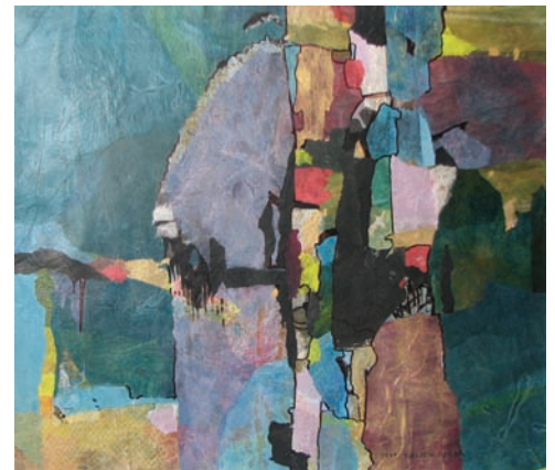
3rd Place Juried ~ Patti Chilbeck Meuler "THE BIG PICTURE"