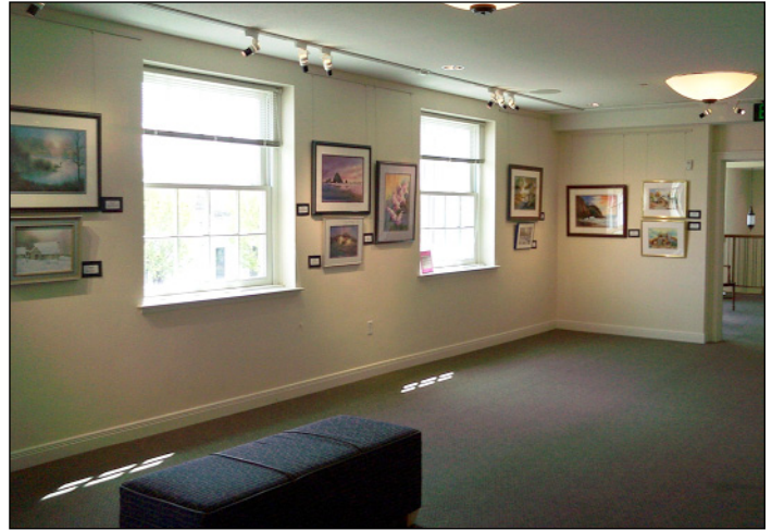
SECOND STORY GALLERY, CAMAS, WA

The deadline for completed applications to be